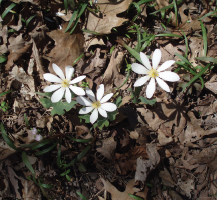
Bloodroot ( Sanguinaria canadensis )