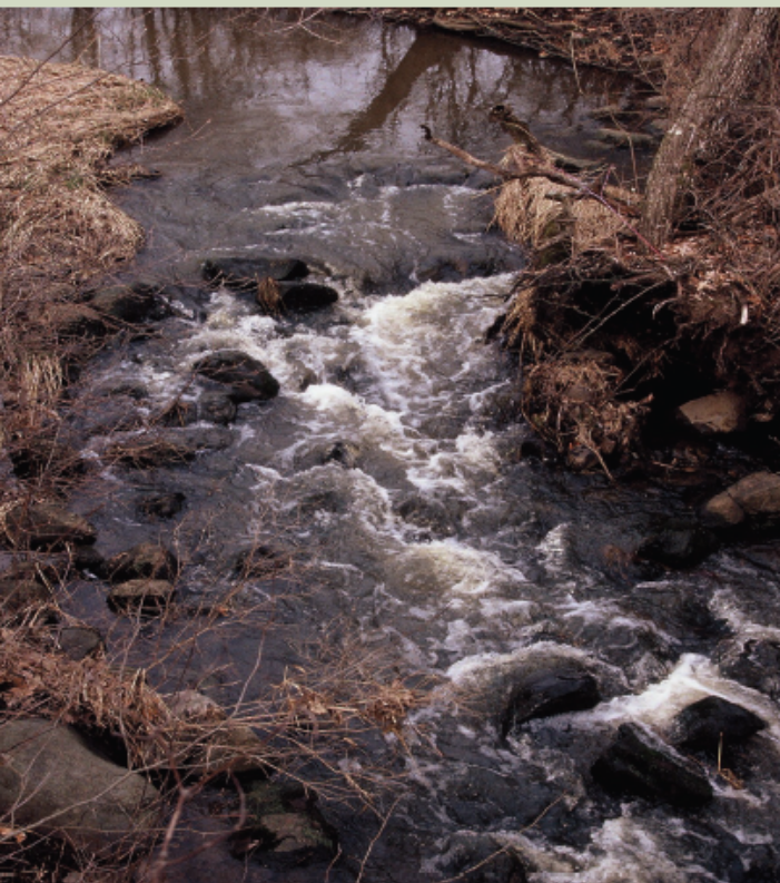
Ryan Creek, Franklin Savanna State Natural Area

The mission of Milwaukee Area Land Conservancy is to preserve and protect valuable land and water resources for the benefit of the public, as well as for the wildlife dependent on these resources, in order to maintain quality of life, biological diversity, and natural scenic beauty for future generations.